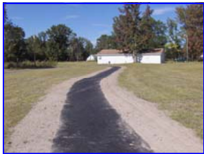
New walking track at Salterstown Park