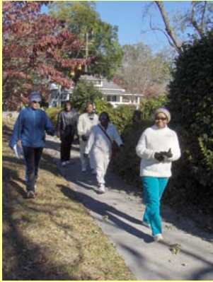
Heritage Health Walk leaders en route