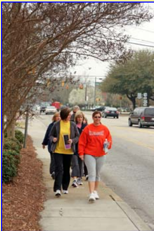
Wednesday Walkers from Thompson Industries