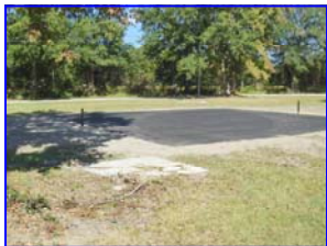
Basketball half-court under construction at Salterstown Park