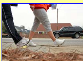
Thompson Industries

Many people observe springtime with “spring cleaning” to remove the dust and cobwebs that have accumulated over the winter months. Not so with SCAL — things stay so busy for us, there isn't time to let the dust settle!